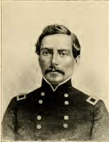
GEN. G. T. BEAUREGARD.

In July, 1861, McDowell moved his splendid army against Manassas. Johnston, brilliantly aided by Stuart and Jackson, completely outwitted his antagonist, hurried over the mountains and joined Beauregard in time to help administer to McDowell the defeat which culminated July 21, 1861, the greatest events of which occurred near the Henry house, on the proposed Park, ending in the most shameful flight on the part of the Federals.